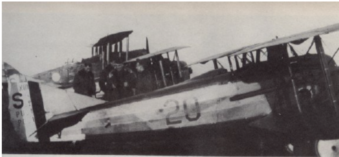
The 22nd Aero Squadron, France, 1918 ----- before the "Shooting Star insignias were adopted and painted on this SPAD.