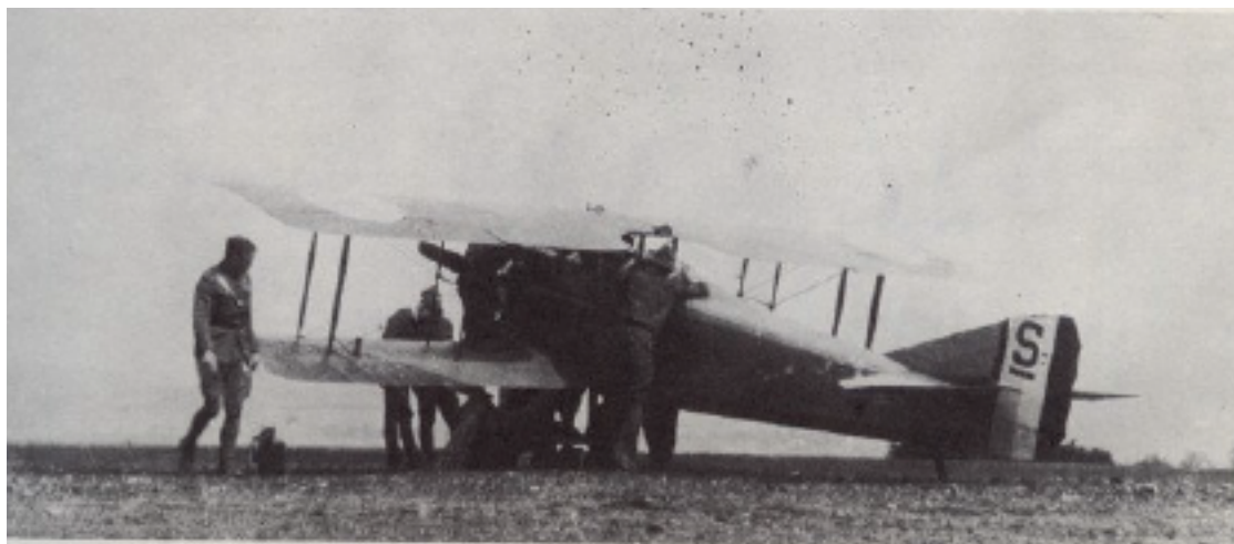
Capt. BROOKS makes a forced landing after engine trouble. Now being repaired, the SPAD is ready for take-off and more service at the Front.