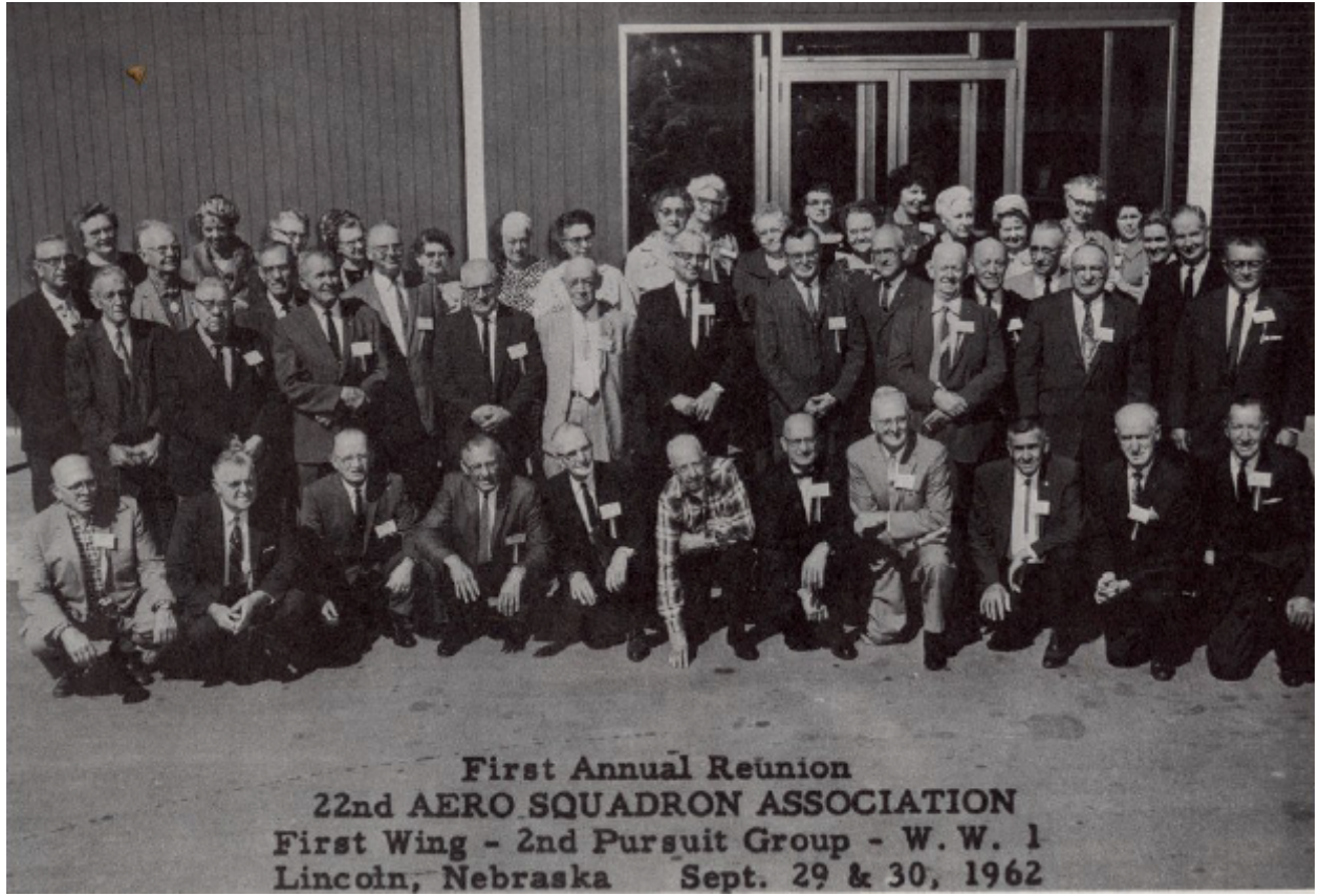
First Annual Reunion 22nd AERO SQUADRON ASSOCIATION First Wing - 2nd Pursuit Group - W. W. 1 Lincoln, Nebraska Sept. 29 & 30, 1962